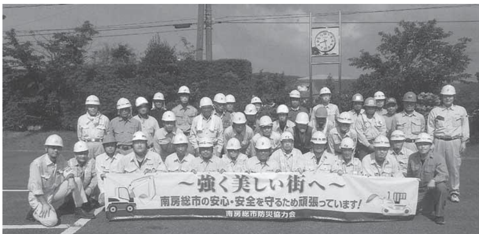
The Members of the Disaster Prevention Association

From July 7 th to 12 th , the City Disaster Prevention Association performed a volunteer grass mowing service on roadsides and other areas.