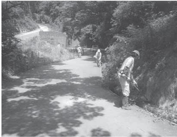
Some of the volunteers cutting weeds at the a roadside