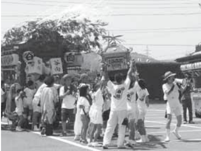
Locally-made parade floats add to the festival atmosphere

A new attraction this year, the Yokohama Hakkeijima Sea Paradise mobile aquarium, was also on display. Curious children crowded around the tank to peer inside.