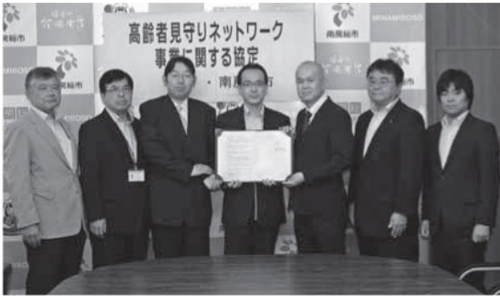
The Mayor, Deputy Mayor, and representatives from the Network

The purpose of Minamiboso's Elderly Protection Network is to let the elderly live comfortable, safe lives in the towns they call home by encouraging the community as a whole to watch over them.