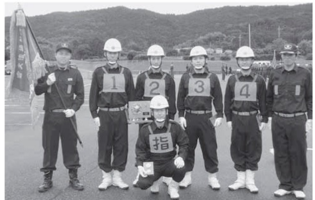
The 5th Brigade 4th Division from Chikura

Representing Minamiboso City, the 5th Brigade 4th Division won the top prize at the 34th Awa Regional Firefighting Competition held on June 21 at the Kamogawa Athletic Field. They will go on to represent Awa in the 51st Chiba Prefecture Firefighting Competition on July 25.