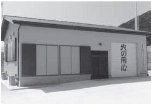
Division 5, Chapter 5's New Station

This year there were 308 new enrollees in middle schools and 238 in elementary schools.