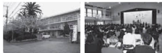
Tomiura Middle School