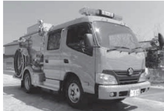
Division 5, Chapter 5's New Firetruck

Furthermore, two water pump fire trucks were purchased to replace old ones. They will be used by Chapter 2 of the 5th division (Shirako, Kawai, Kubo, and Seto Nagai districts of Chikura) and Chapter 1 of the 7th division (Hanasono, Shiba, and Nigaura districts in Wada).