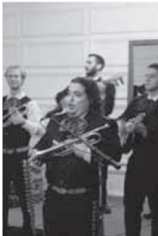
北テキサス大学のマリアッチ楽団 A mariachi band at the University of North Texas

シンコ・デ・マヨというのは、スペイン語で5月5日という意味です。1862年5月5日は、メキシコ軍がプエブラ市からフランス軍の侵入を撃退させた日で、メキシコとアメリカでは記念日として祝われています。その戦争が終わってからは、アメリカ大陸の国がヨーロッパの国に侵攻されたことは一度もないので、シンコ・デ・マヨは重要な出来事でした。メキシコ人とメキシコ系アメリカ人はシンコ・デ・マヨを祝い、メキシコ人であることを誇りに思っています。けれども他のアメリカ人は、5月5日をメキシコ料理を食べ、お酒を飲んだりする口実に使います。メキシコ料理のレストランでタコスやケサディーヤなどを食べながら、メキシコ産のビールやマルガリータを飲んで祝います。(マルガリータというのはテキーラに果汁と氷を加えたカクテルです。) また、マリアッチ音楽もシンコ・デ・マヨに欠かせないものの一つです。マリアッチ楽団は、ギター、アコースティック・ベース・ギター、トランペット、バイオリンとボーカルの組み合わせが典型的で、メキシコ料理のレストランでよく演奏しています。特徴的なものとして、ソンプレロというつばの広い帽子を被っています。私がシンコ・デ・マヨを好きな理由は、なんといってもメキシコ料理が世界で一番美味しいと思うからです。