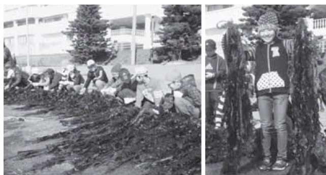
Shirahama 5th Graders seeing how big the seaweed got