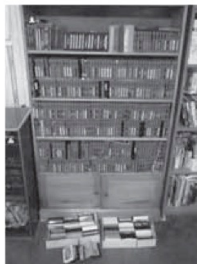
My retro game collection 私のレトロゲームコレクション

ゲームを収集するというのは日本でもってこいの趣味です。いい店が多くあり、アメリカより、日本の中古ゲームのほうがいい状態です。たとえば、カセットがきれいで、ビニールで包まれています。また、日本の中古ゲームは状態により値段が変わりますが、アメリカでは、汚れていても、落書きされていても、ラベルがはがされていても値段が変わりません。やはり、日本はレトロゲームを趣味にしている人には素晴らしい国です。