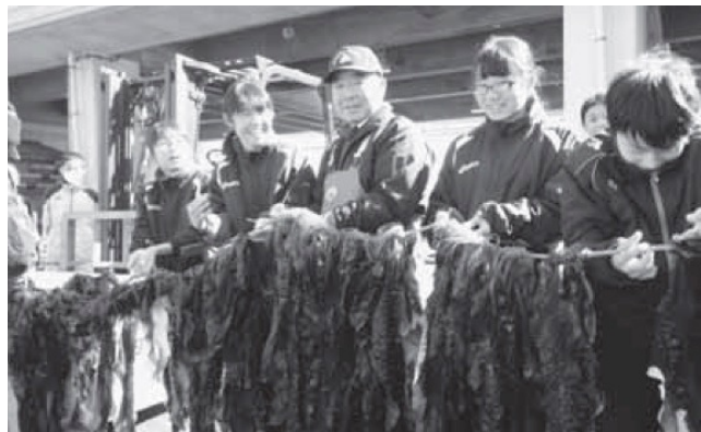
Students from Tomiura Middle School

The students' families have said good things about the seaweed brought home to them, stating that it has a nice consistency and flavor.