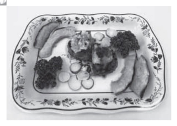
Judges' Choice / Chikura Eateries Association Prize

~How to Make Award Winning Food~ #3 http://civil.mboso-etoko.jp/chisan-chisho/recipe/