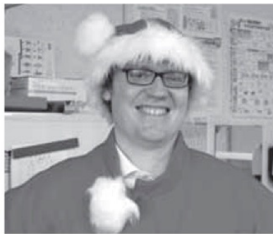
Merry Christmas! メリークリスマス!

実家から6000マイル離れて暮らしている今年は、自分の家にある小さいトースターオーブンでシナモンロールを作りたいと思っています。