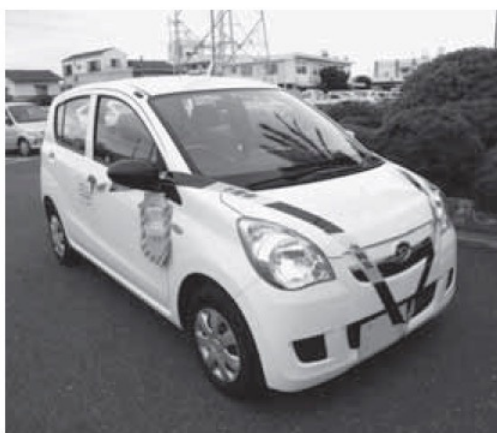
A "Mirror Lock" used to seize cars

Chiba Prefecture General Affairs Department, Tax Division (TEL: 043-223-2127)