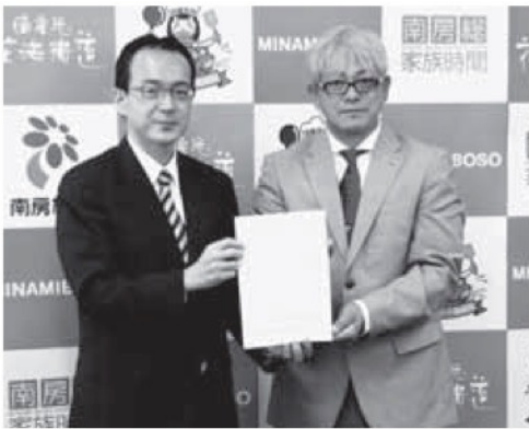
The mayor conferring the title on November 6